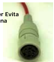
Draeger Evita or Savina