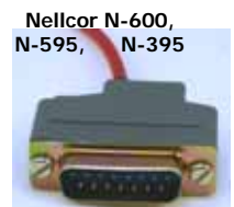
Nellcor N-600, N-595, N-395