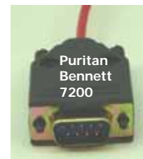
Puritan Bennett 7200